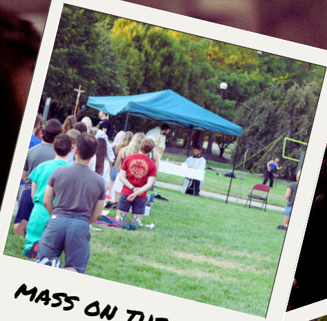
MASS ON THE GRASS