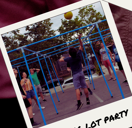
PARKING LOT PARTY

The Fall 2023 semester is off to a great start! Sunday Mass was standing room only and was packed full of students and their parents. We were on campus everyday reaching out to new students., playing games, tabling, and getting the word out about Catholic Bearcat.