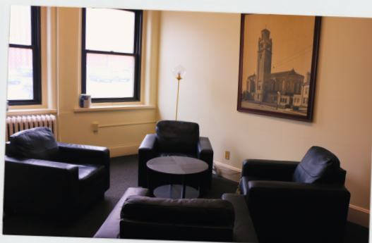
SPIRITUAL DIRECTION ROOM