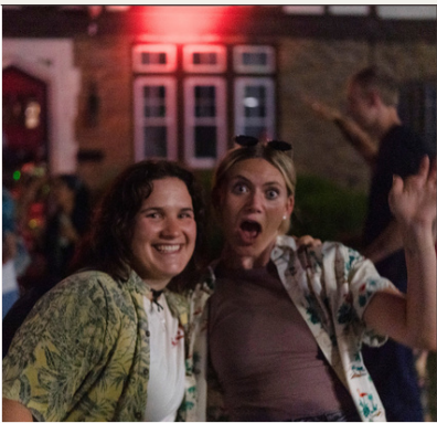
RED C PARTY