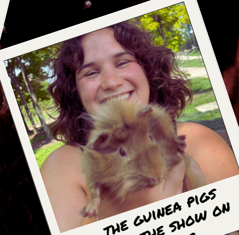
THE GUINEA PIGS STOLE THE SHOW ON CAMPUS