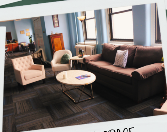
BIBLE STUDY SPACE